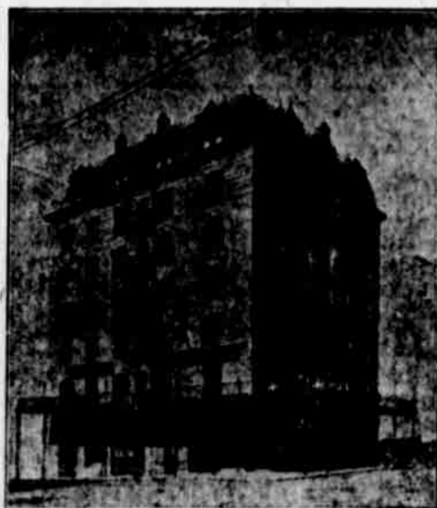
THE VICTORIA HOTEL

When in Spokane Don't Fail to Stop at the Victoria