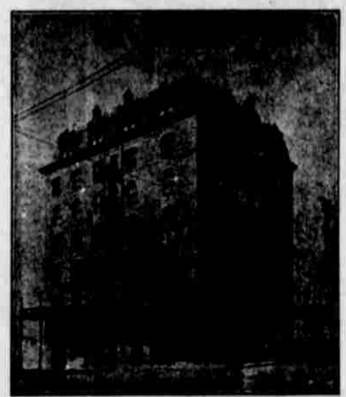
THE VICTORIA HOTEL

When in Spokane Don't Fail to Stop at the Victoria