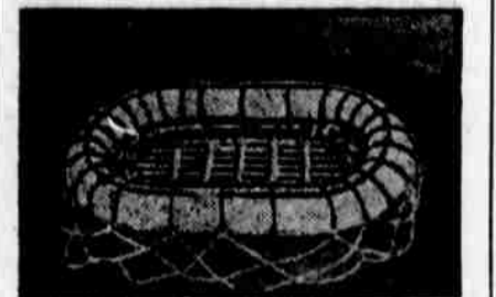
THE LIFE RAFT.

Device that is Absolutely Non-Sinkable and Non-Capsizable. A non-sinkable, non-capsizable life raft has at length been invented and several of the craft are now on the war ships of Uncle Sam. It possesses strength, buoyancy, lightness and capacity. It consists of a copper tube, with many air-tight compartments strengthened with fins, its shape being an ellipse, somewhat flattened. Attached to this float is a rope netting, three feet deep, suspending a wooden-slatted bottom. The netting is suspended on the inner side of the float from rings which travel on lashings, thus permitting it and the bottom to fall through and be in right relation, whichever side of the float may fall upon the water. Oars and signal flags are lashed to the sides, while a breaker of water and boxes of food can be lashed to the tube. The copper tube is covered with muslin and painted with a waterproof non-corrosive substance, outside of which