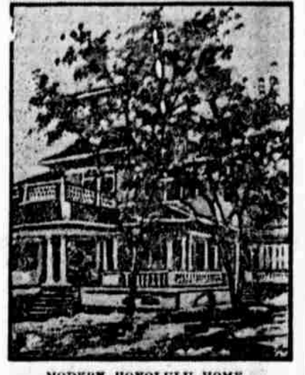
MODERN HONOLULU HOME.

Improvements Have Entered Into the Lives of Hawaiians. It is a far cry from a grass-thatched hut to a modern palace with pillars and porticoes, stone foundations and marble floors, but a few short years has witnessed this change in Hawaii, the beautiful summer garden of the Pacific Ocean. It is less than a decade since the people of that country lived almost exclusively in huts, windowless and with but one door for ingress and