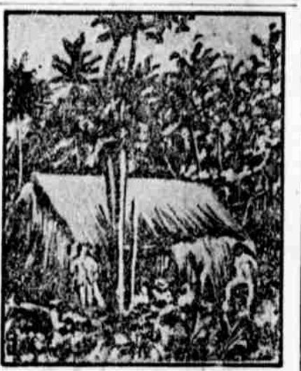
OLD NATIVE DWELLING HOUSE.

egress. From a distance these habitations looked not unlike haystacks that dot the prairies of the West. But civilization took root easily in the tropical country. The brown-skinned, sunnily-dispositioned people were apt at imitation, and the manners and customs of America soon became the manners and customs of Hawaii. Now the islands have been modernized and Americanized. The huts have given way to handsome palaces and well-built dwellings. The dirt floors have been replaced with polished woods and glancing marble. The