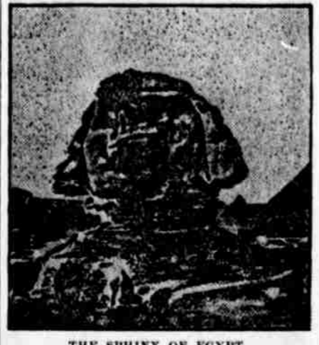
THE SPHINX OF EGYPT.

Changing Climate Affects the Marvel of the Ancient World. It is declared upon the highest authority that rapid decay has set in in that marvel of the East, known as the Egyptian Sphinx.