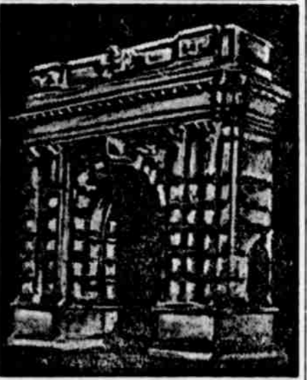
JEFFERSON DAVIS ARCH.