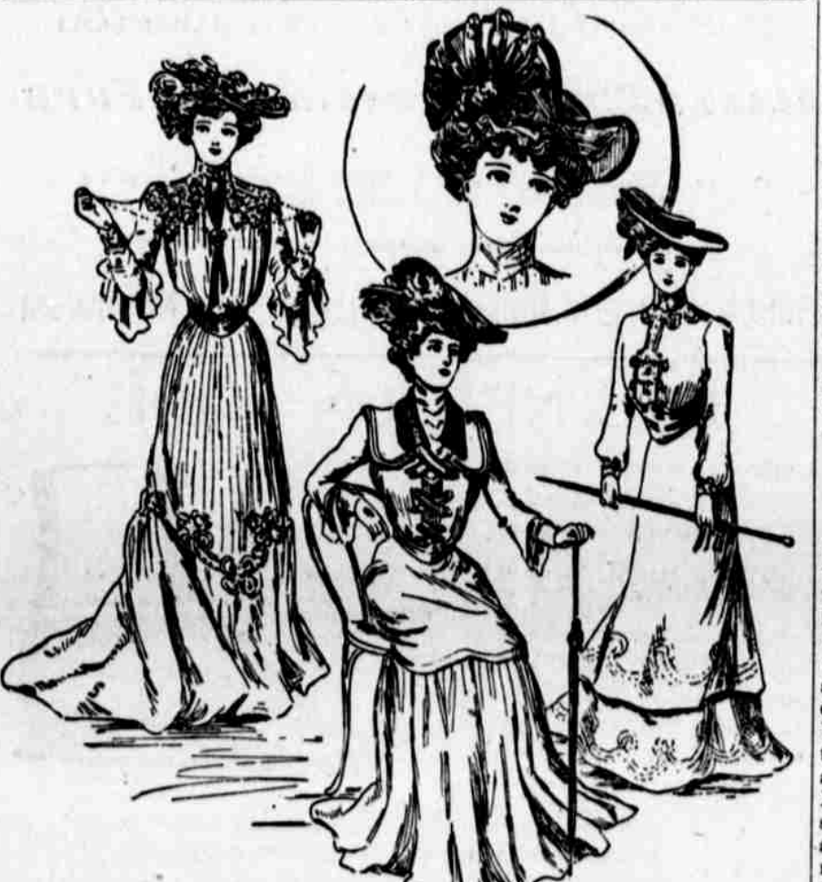
STYLISH USE OF CLOTHS.

For half mourning or the woman who wears violet there is a circle of violets and chiffon to match, for the hair, with the flowers and chiffon massed a little more closely at one side of the front. The fancy striped velvets used for trimming are very beautiful in coloring and are combined with satin-faced cloths, lighter wool fabrics and silks, which in plain colors are coming in again for entire gowns. For the woman who wears crape beautiful things are made for the neck, and a box of crape with satin-faced cloths, lighter wool fabrics and silks, which in plain colors are coming in again for entire gowns. While gray suede is the most desirable leather this season, especially for accompanying "high toots," many women, desiring to make a difference between their dress adjuncts and those for every day, have accorded quite high favor to pigskin.