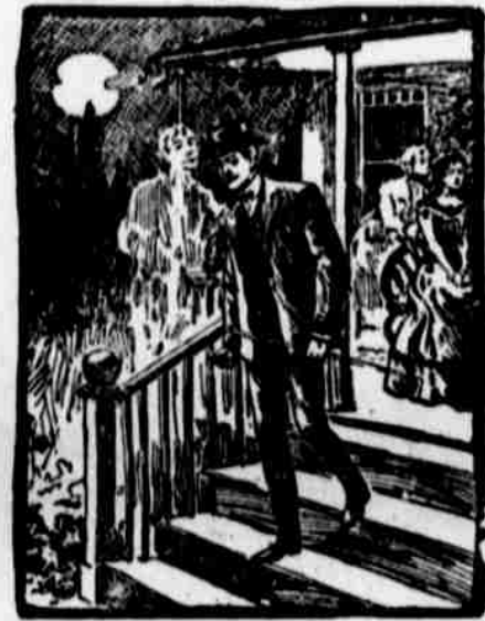
"ONCE I ACTED AS YOU ARE DOING."

THEY were two happy ghost lovers, and they had slipped down to earth again to see how it fared with earth-bound lovers now.