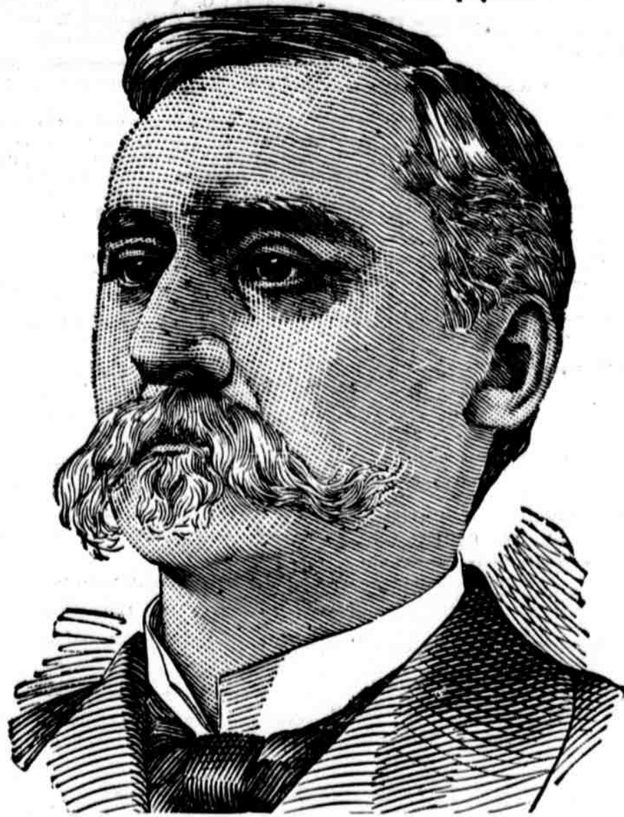
Hon. W. N. Roach, United States Senator From North Dakota.

Says Peruna, the Catarrh Cure, Gives Strength and Appetite.