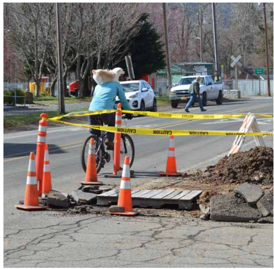
Pedestrians skirt cones surrounding road excavation on Baseline in Parkdale across from Lady Fern and Solera Brewery Wednesday. Parkdale Sanitary District issued a boil water order at 9 a.m. Wednesday, pending repairs, after a main line was exposed and a valve replaced. District officials said laboratory test results came back clean on Thursday at 3:30 p.m. and gave the okay to affected customers to use water as normal. (Under the order, water needed to be boiled when used for consumption or kitchen use and hygiene but not for bathing or clothes washing.) The order affected customers north of Baseline only.