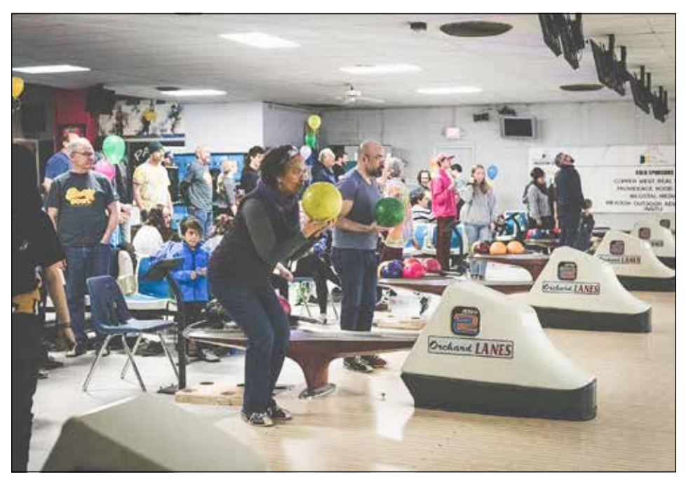
Bowlers gather March 7 at Orchard Lanes to raise funds for The Next Door's GYM program at the annual Buddy Bowl.