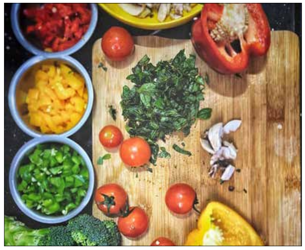
THE FREE, five-class "Seed to Supper" series begins Monday, April 13 at FISH Food Bank.