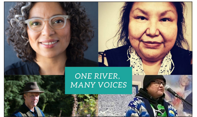
ONE RIVER, MANY VOICES

The program is presented by Humanities Washington and Washington State Arts Commission, and made possible by the Academy of American Poets.