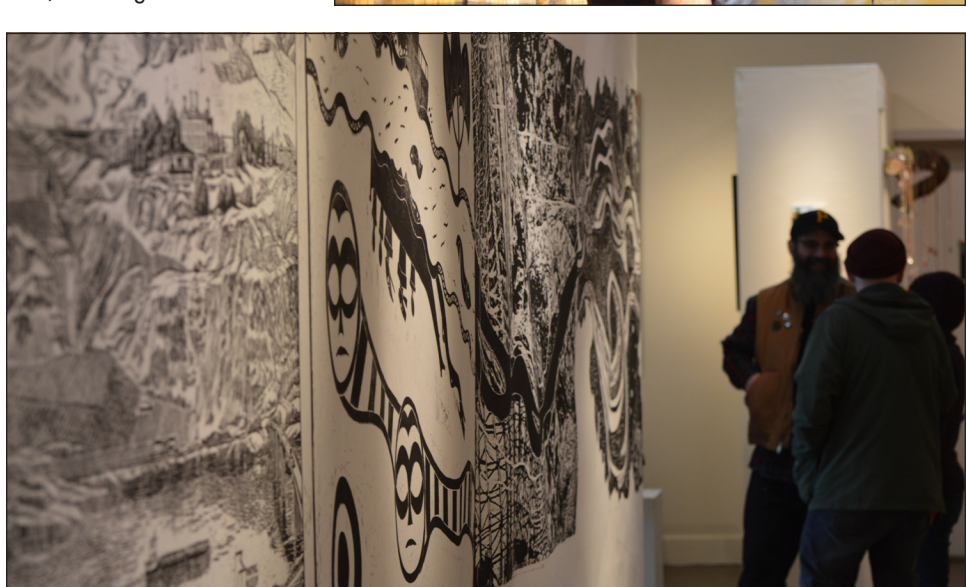
VISITORS view the lead portion of the 66-foot collaborative Exquisite Gorge mural, on display through March at Columbia Center for the Arts.