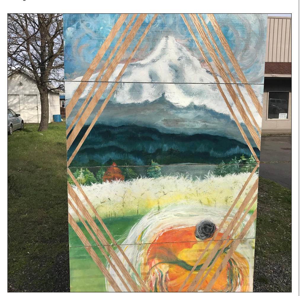
NEWEST addition to the Art of Community outdoor gallery, aka "Big Art," is this six-foot painting on wood by Yasmin Arlette Acosta-Myers of Hood River, on 13th Street near B Street, installed last month.