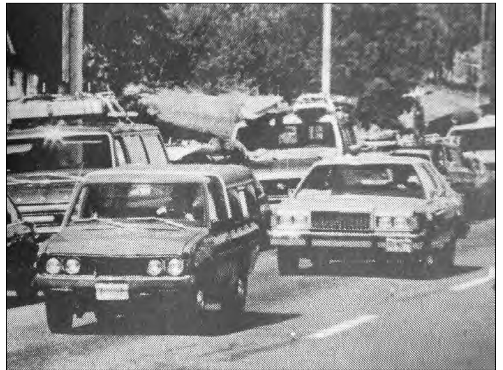
JULY 10, 1985: Cars with sailboards strapped to the top are becoming standard fare in Hood River this summer. That's especially true right now, while the Columbia Gorge Pro Am Speed Slalom is in progress. More sailboarding businesses downtown locations has concentrated the effect.