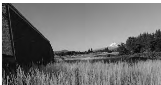
PROPOSED PARK PROPERTY on Guignard Road, just southeast of the transfer station property. This view looks south to Mt. Hood. At left is a building in neighboring property, formerly Italstone.

The land is mostly flat, though it contains a wetland that would likely be preserved and incorporated into the park, according to Stirn. Access would be from Guignard Road, and the preliminary design sets aside parking for about 40 cars. Stirn emphasized it would qualify