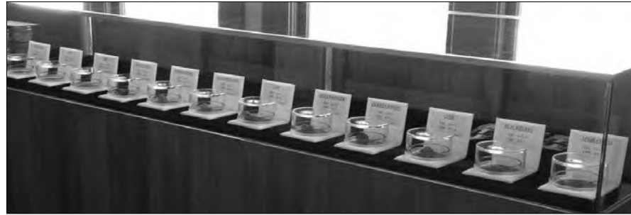
MARIJUANA SAMPLES displayed for sale at Gorge Green Cross.

Hood River Police officers have pulled over Washington drivers and