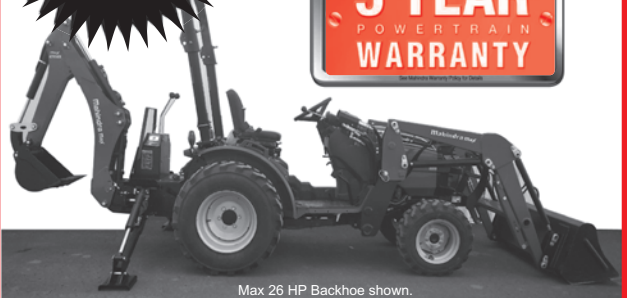
Max 26 HP Backhoe shown.