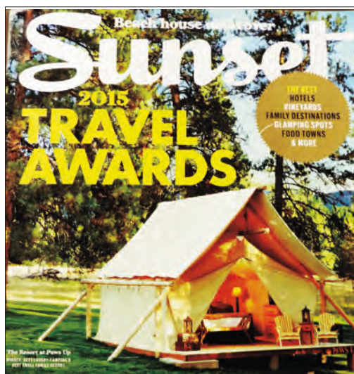
The June issue of Sunset Magazine has named Hood River "Best Adventure Town."

Sunset's article was its second about Hood River in three months. The April edition profiled Hood River and the Fruit Loop as a destination, describing the city as "surrounded by pear, apple and peach orchards" and the Fruit Loop as "a 35-mile stretch of road dotted with fruit stands and lavender farms". It added that, "In May this Columbia gorge town hits its stride: the river begins to warm, breweries open their patios, and the new waterfront park fills with picnickers."