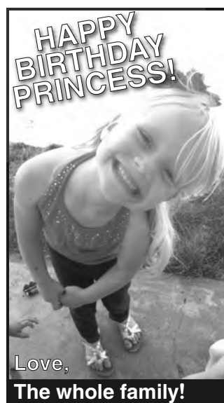
Love, The whole family!

Hood River campus, has been canceled for the week of May 25. It resumes Monday, June 1 and continue through Wednesday, July 15.