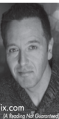
(A Reading Not Guaranteed)

Get Tickets TODAY! 1 (800) 514-3849 JohnEdward.net or ETix.com