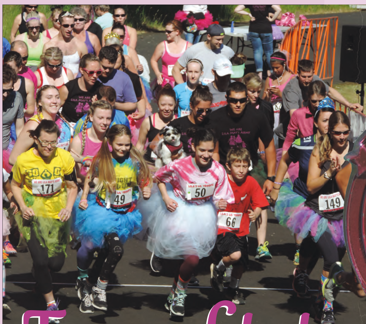
THEY'RE OFF: 3K runners of all ages start their race/walk. Participants chose from the kids' race, walk, 3K, 5K and 10K.