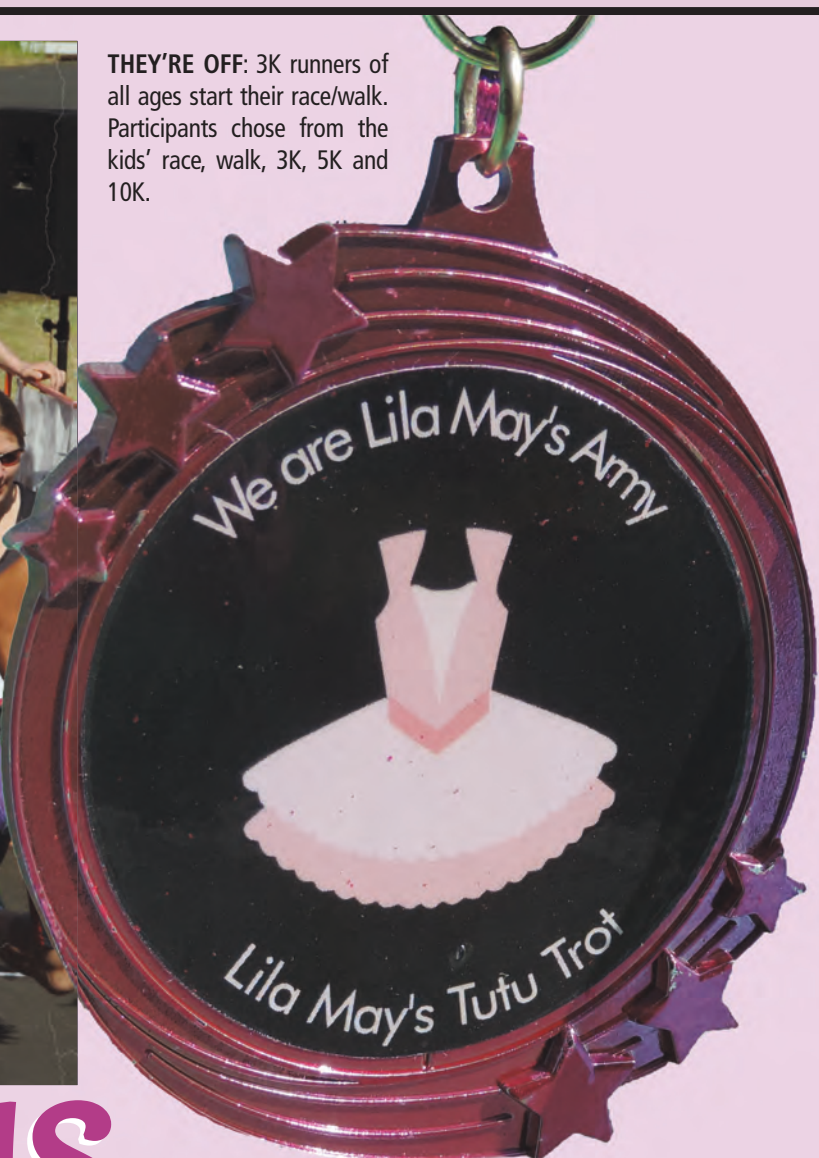
LILA MAY MEDALLION