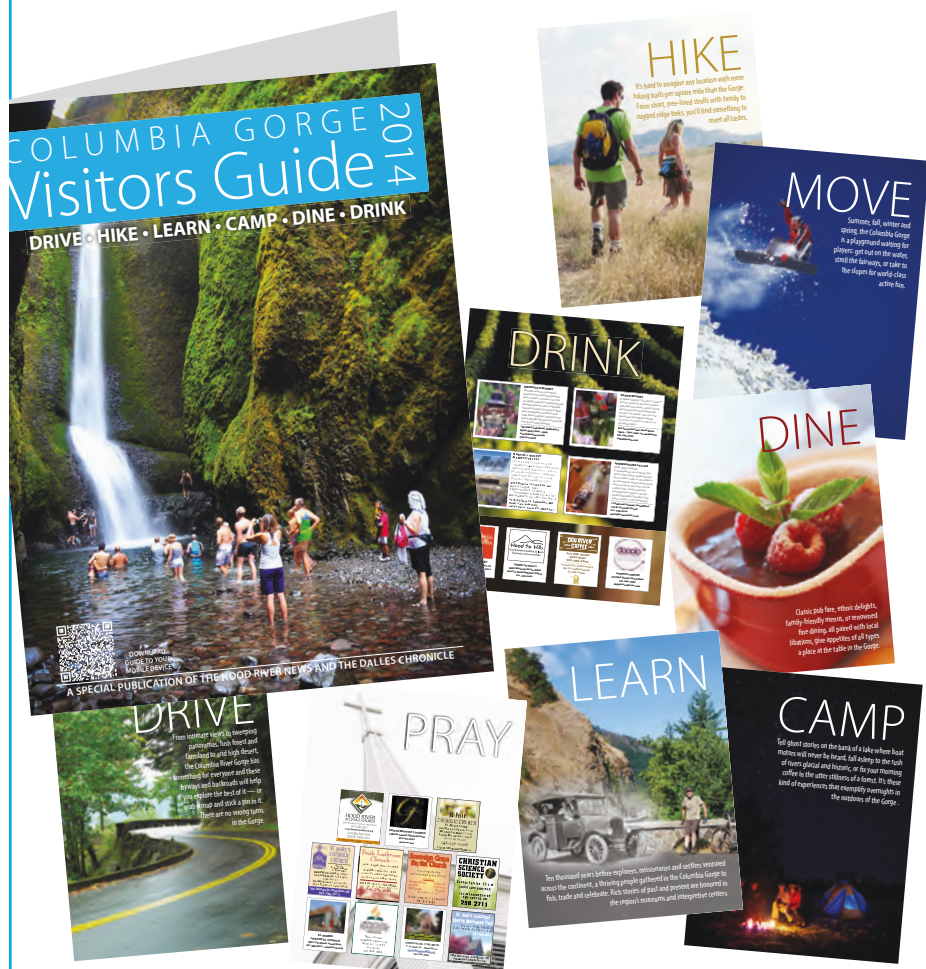
A publication of Hood River News & The Dalles Chronicle. Distributed in OR & WA.