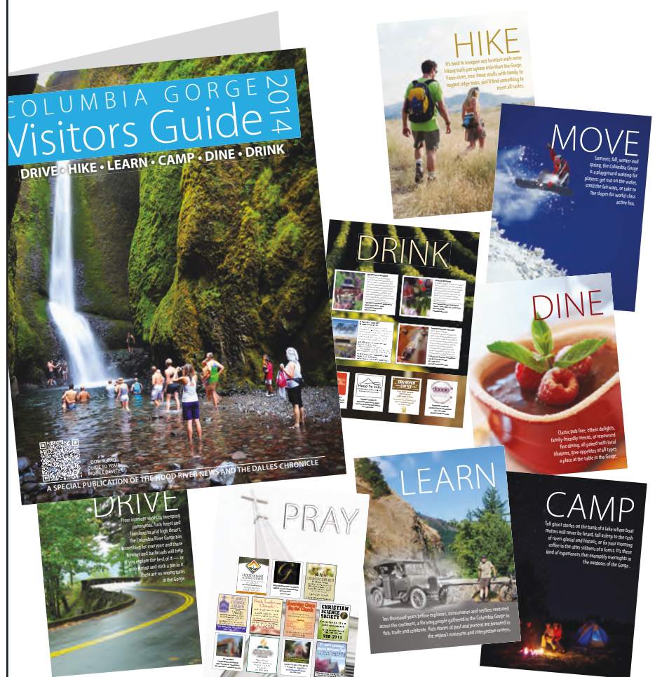
A publication of Hood River News & The Dalles Chronicle. Distributed in OR & WA.