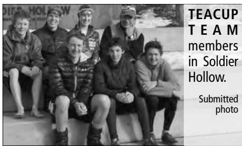
TEACUP TEAM members in Soldier Hollow.