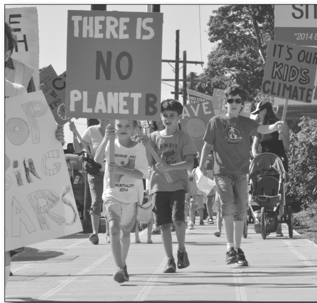
IN SEPTEMBER: About 200 people attended a climate change rally in Hood River, organized by the Columbia Gorge Climate Action Network.