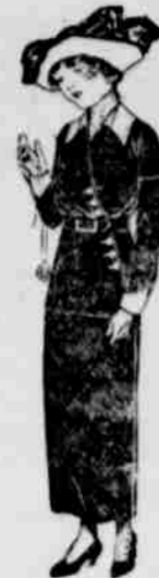
1913-Misses' Dress Sizes 14, 16, 18 Years.

You will find what you want in the line of millinery if you will visit our Millinery Department. We carry the largest assortment of the newest shapes and creations as well as a dandy line of shade and knock-about hats for Ladies, Misses and Children. Call and see for yourself. 2nd Floor.