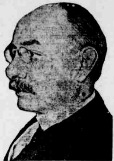
Walter H. Page, the Magazine Editor, who was named American Ambassador to Great Britain.