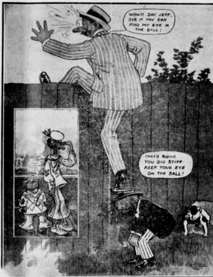
Mutt and Jeff—Coming Friday