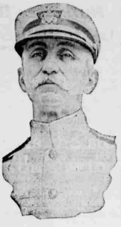
By Rear Admiral BRADLEY A. FISKE of the United States Navy