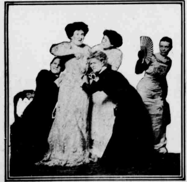
Scene from "Lottery Man" to be presented at Monroe Opera House, Friday, Nov. 8.