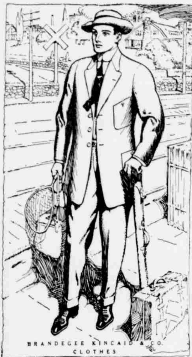
BRANDEGEE KINCAID & CO. CLOTHES

Wash Goods Dep't. New Arrivals abounds in values-- Lilly's Suit Cases and Wool Dress Goods also English Bags. Prices reduced 20%. Get ready 20% under will prevail for school. during August.