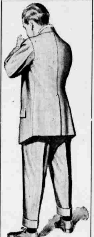
Ederheimer, Stein & Co. MAKERS

$25.00 Suits $20.00 $20.00 Suits 16.00 $18.00 Suits 14.40 $16.50 Suits 13.20 $15.00 Suits 12.00 $13.50 Suit 10.80 $12.50 Suit 10.00 $10.00 Suit 8.00 $8.00 Suit 6.20 $6.50 Suit 5.20 $5.00 Suit 4.00