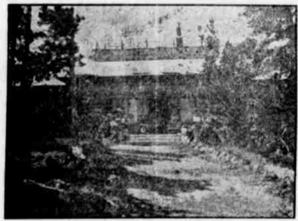
CLOUD CAP INN

Daily automobile service between Hood River and the Inn will afford exceptional opportunity to make the pleasant journey. The Inn is located 5987 feet up the side of