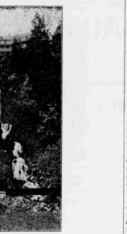
MINERAL SPRINGS GROUNDS IMPROVED

The large hotel and resort building that is to be erected will be a fire proof structure, and it is stated by officers of the company that the en-