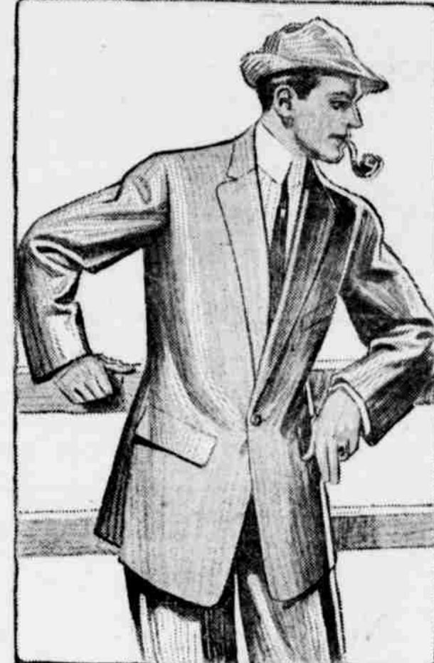
Ederheimer-Stein Young Men's Clothes

Florsheim Shoes Duttenhoffer Shoes, Nap-a-Tan Shoes, Ladies' or Men's Every pair reduced