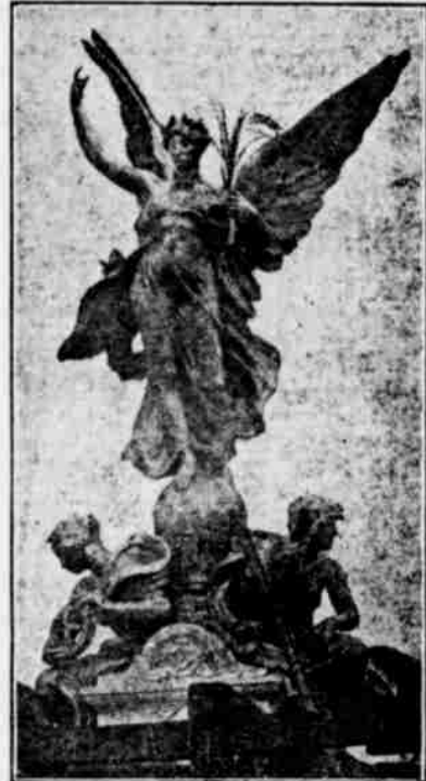
TWELVE FOOT GILDED BRONZE "VICTORY" WHICH DOMINATES THE VICTORIA MEMORIAL.