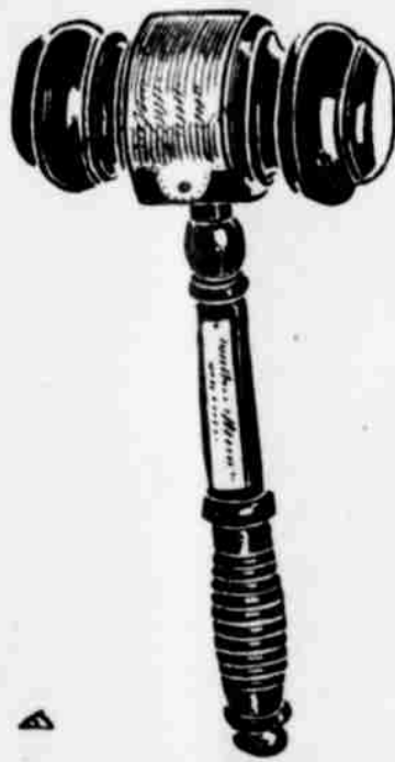
THE HISTORIC GAVEL.