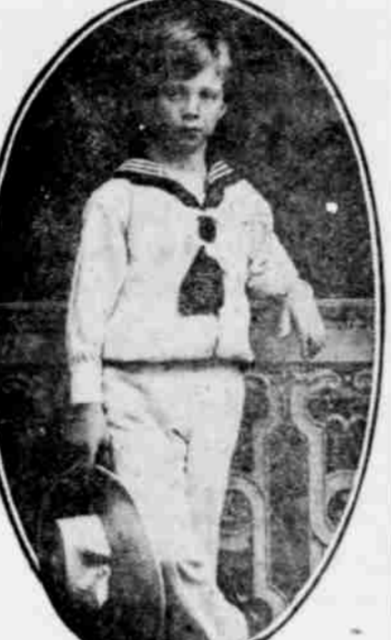
CROWN PRINCE LEOPOLD, the American legations at Rio Janeiro, Lisbon and Brussels before becoming the property of the crown prince.

As the proverb has it, every cloud has its silver lining, then the parrot that now is a resident of the royal palace at Brussels is not an out and out nuisance. Though this bird has interfered with the statecraft of King Albert of Belgium he is still an honored guest of the royal abode because he is a pet of Crown Prince Leopold.