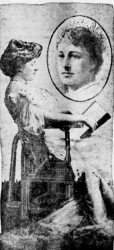
DUCHESS OF DEVONSHIRE (TOP) AND MARCHIONESS OF GRAHAM.

The idea originated at a social tea when it was discovered that the Christian name of every woman in the room