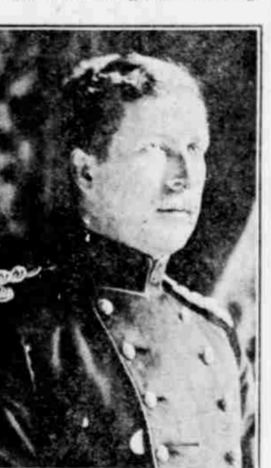
KING ALBERT OF BELGIUM.

Such a sudden spring to the pinnacle of notoriety could not escape the youthful crown prince, and when Minister Bryan discovered the royal interest in his possession he promptly presented it to Leopold. For a few days the parrot was a welcome guest in the king's