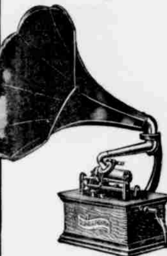
Hood River Studio Hood River, Ore.

And if you will come in and see this "BKT" outfit you'll believe it. A new aluminum tone-arm cylinder machine with flower horn and 6 records, costing $37.10. Plays both 2-minute and 4-minute records. Other outfits from $20 up—and you can buy them all on easy terms.