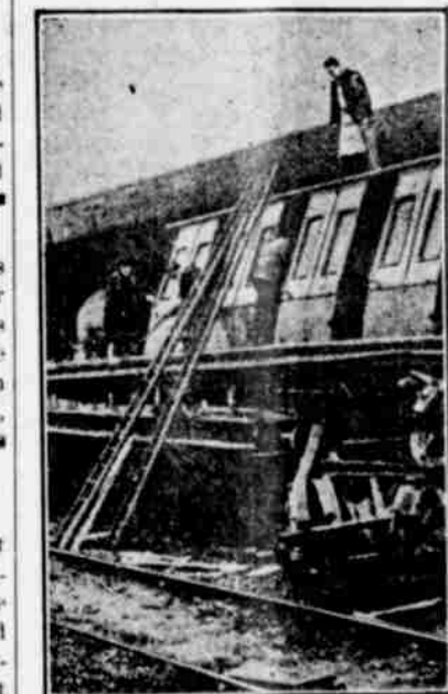
TRAINS TELESCOPED AT STATION.

But accidents do happen in England just the same as elsewhere, and when they occur they are not always the result of causes that could not be avoided. When a speeding express train runs into a local train standing at a station it means that some one