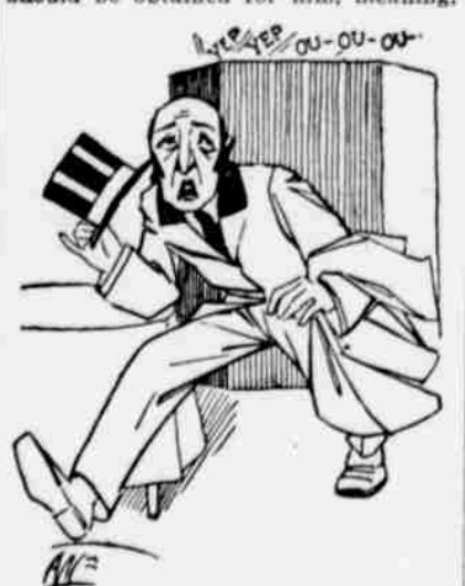
FIRED WILDLY INTO THE STREET

A Suggestive Bark. The man who ruined a sausage maker's trade by walking into his shop with a sackful of dead cats and dumping the contents down on the counter now finds a rival—albeit an unintentional one—in the person of a London waiter. The latter worthy, being asked by a customer for sausages, replied that there were none left, but, being of an obliging disposition, he went on to say that if the gentleman did not mind waiting for a few minutes some should be obtained for him, meaning,