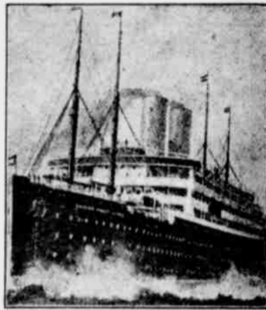
THE KAISERIN AUGUSTE VICTORIA.

Here are a few figures bearing upon the subject. In 1907 the outgoing transatlantic travel from New York consisted of 100,706 who traveled first class, of 108,272 who went in second cabins and of 557,233 who crossed in steerages. The statistics for 1908 showed a marked decrease, as did those of last year; but, as stated, all records for ocean travel promise to be broken during the season of 1910.