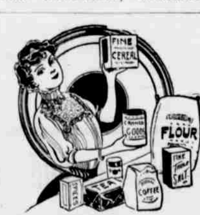
You'll Have Your Hands Full

to find better groceries than HORSES, COWS, PIGS, CHICKENS, ETG. to find better groceries than we offer. Don't say you can without first examining ours. That's only fair to both you and ourselves. The better judge of quality and value you are the surer we are of your orders. Sole agents for CHASE & HORSES, COWS, PIGS, CHICKENS, ETC. For Sale—Good farm horse; weight 1150 pounds. Price 285. Phone 181M. 30-386. For Sale—A team of light farm and road horses; sentle, sound and willing. Can be had if taken at once for £150 cash. Address box 216 Hood River. Oregon. 33-386. For Sale—Standard bred white Leghorn cockerels from trap nested sacek, with high egg records. $1.80 cash. W. H. Tobey, Parkdale. Ore. 32-35c. For Sale—A fine well broke hunting dog. Write for particulars to F. Leslie Haskins, R. D. No. 1. Hood River, Oregon. 33-360. Jerwy Cow For Sale—Call 293M or see C. E. Markham. 33-360.