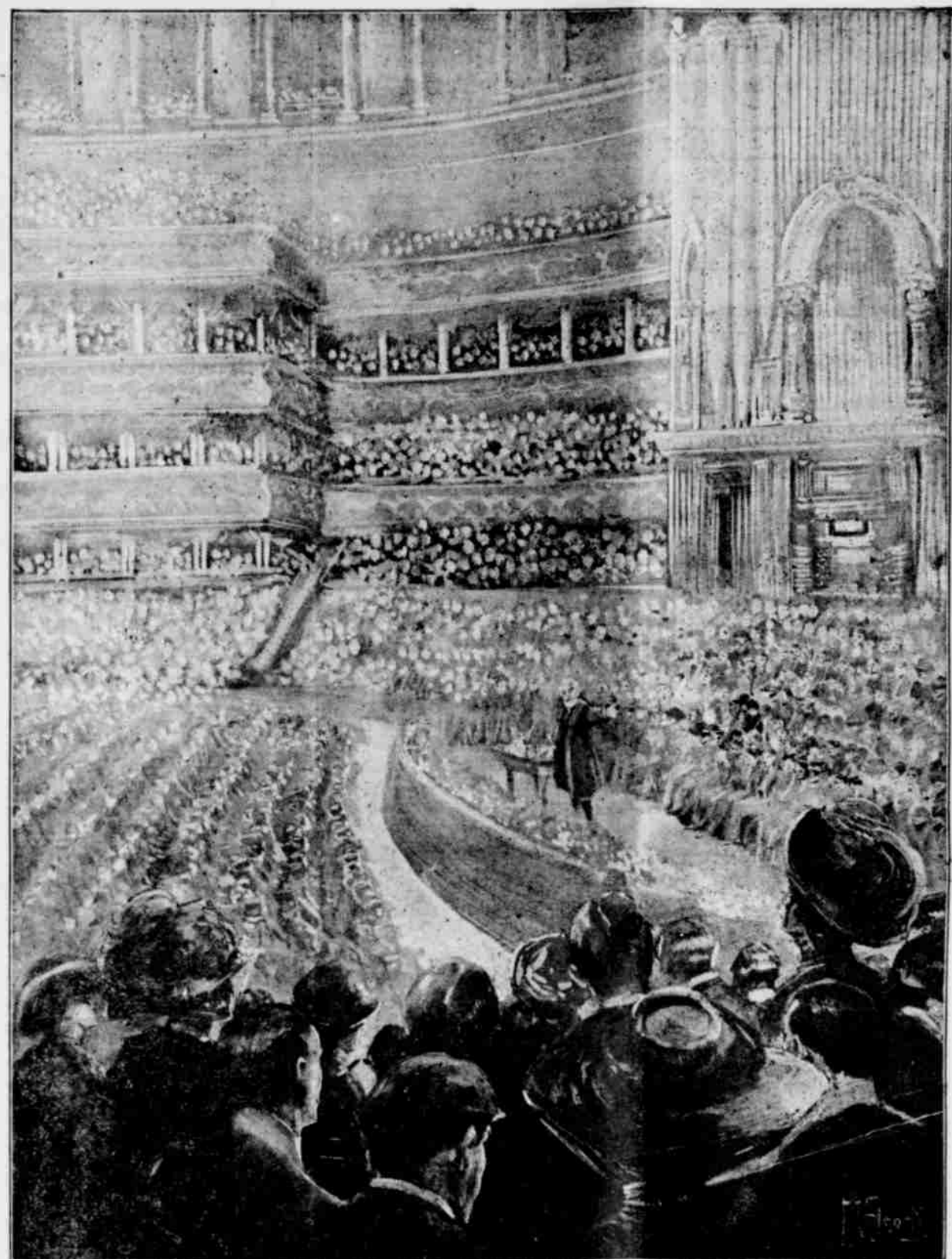
REPRODUCED FROM "BLACK AND WHITE," LONDON'S PRINCIPAL ILLUSTRATED NEWSPAPER.

The Royal Albert hall, London, England, is the largest and finest auditorium in the world. It was here that Pastor Russell delivered his now famous remarks of consolation and comfort to the bereaved royal family of the late King Edward VII. Pastor Russell was the principal speaker in the three Royal Albert hall 1910 Sunday May meetings of the International Bible Students' Association held May 8, 15 and 22 respectively. His opening remarks