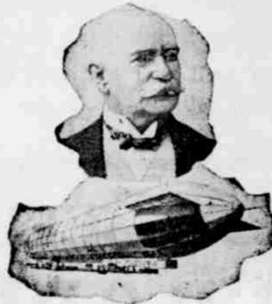
COUNT ZEPPELIN AND HIS AIRSHIP.

The dimensions of the Deutschland are: Extreme length, 485 feet; greatest