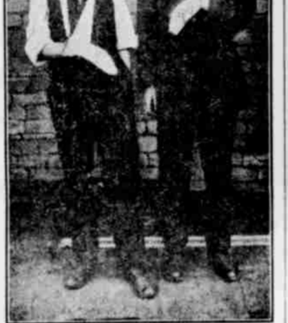
AFTER THE CELEBRATION.

Last year, owing to the work of those who are agitating the "sane