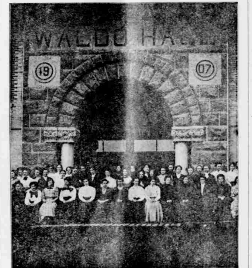
THE O. A. C. GIRLS WHO WILL TAKE PART IN THE CELEBRATION JUNE 14.