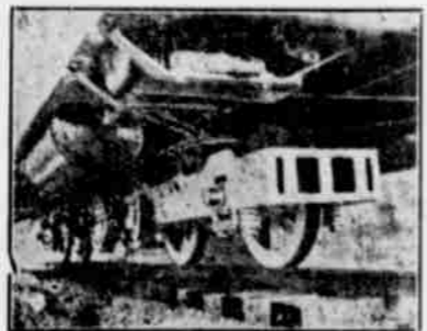
NEW VIEW OF THE BRENNAN CAR.

A new car has just been built by the inventor, the system further improved, and the tests being made in London