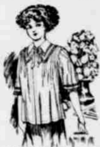
5219—Ladies' House Dress. Sizes 32, 34, 36, 38, 40, 42 inches bust measure.

We have just unpacked a splendid assortment of new Gingham and Percale house dresses, nicely made in every respect. One and two piece, plain colors and stripes. Just look them over. All sizes, and cost you less than the making. House Dresses for—