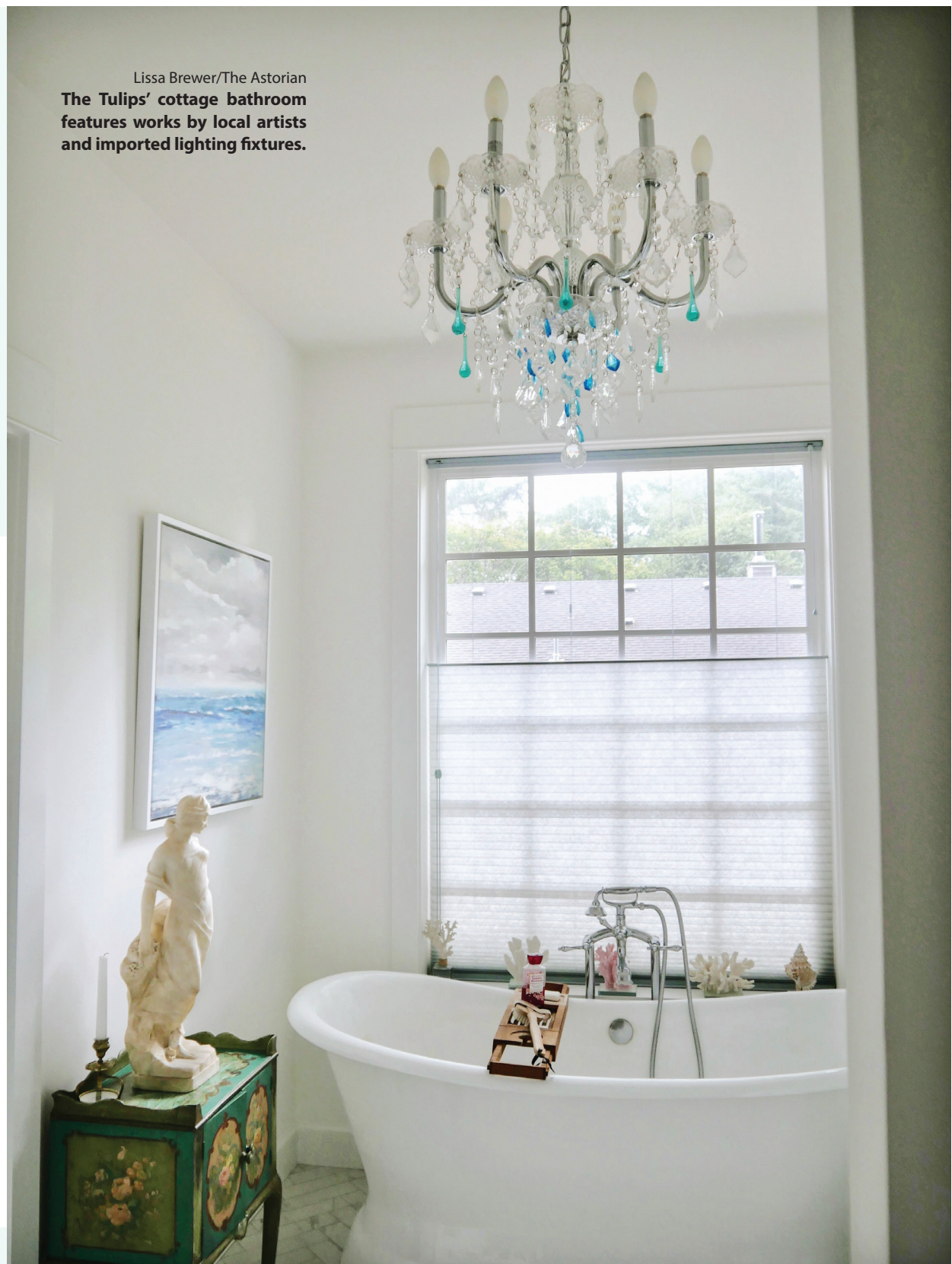
The Tulips' cottage bathroom features works by local artists and imported lighting fixtures.