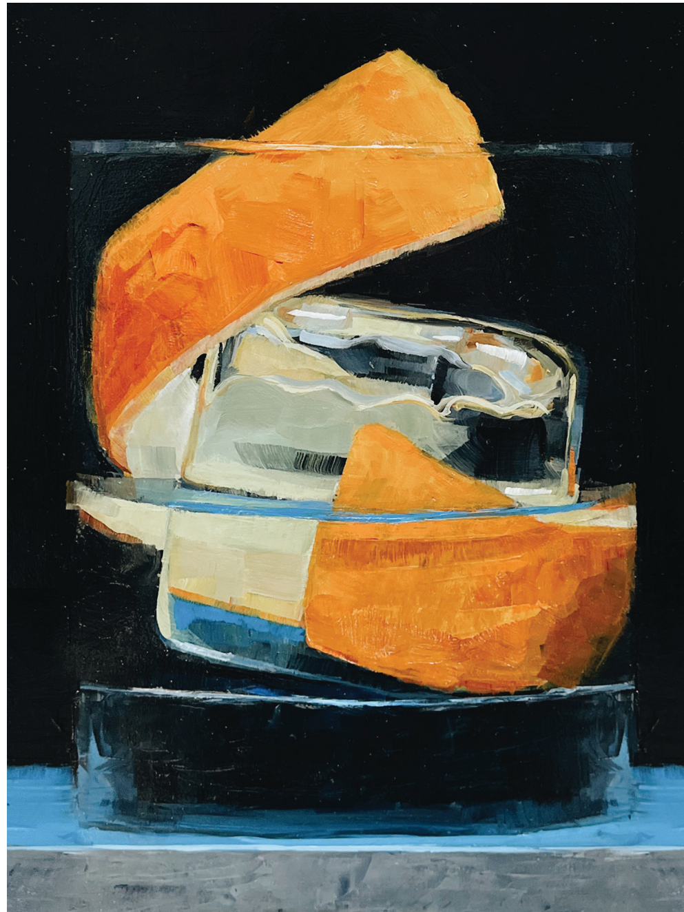
"Old Fashioned Water," by Tom Giesler, shown at RiverSea Gallery.