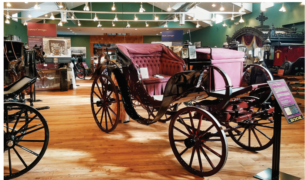
One carriage features violet cushion seating.