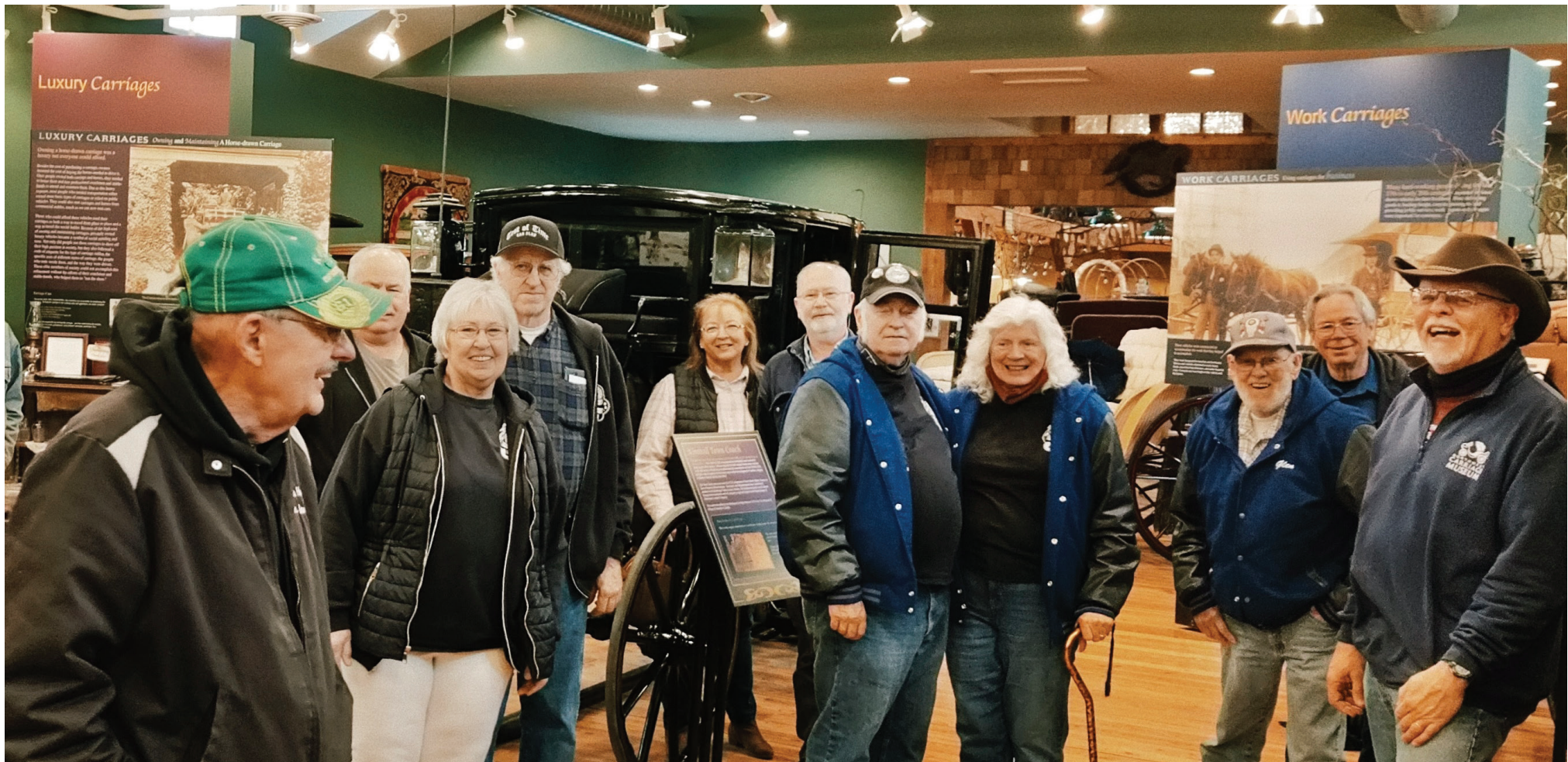
People smile and laugh during a group tour at the Northwest Carriage Museum.