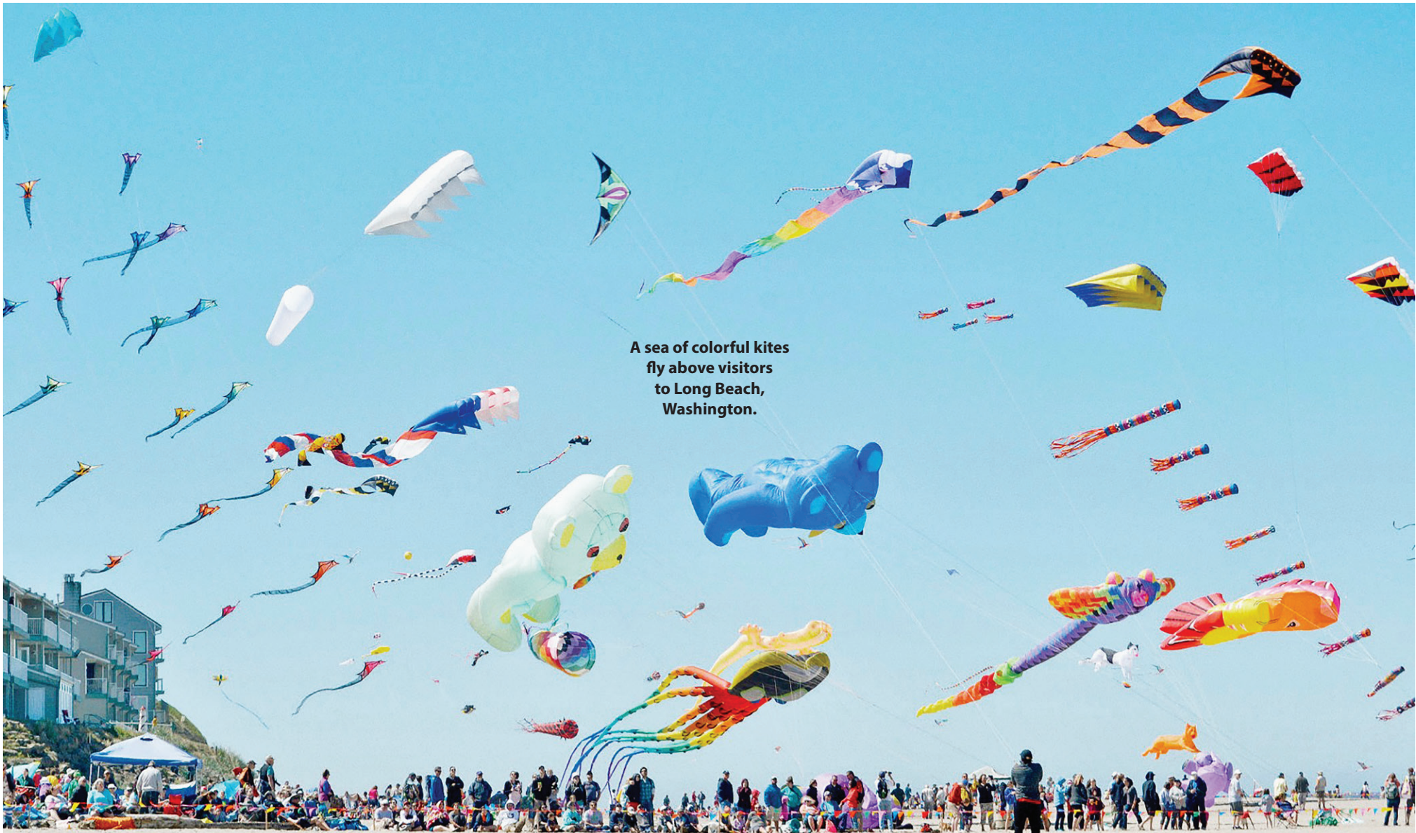
A sea of colorful kites fly above visitors to Long Beach, Washington.